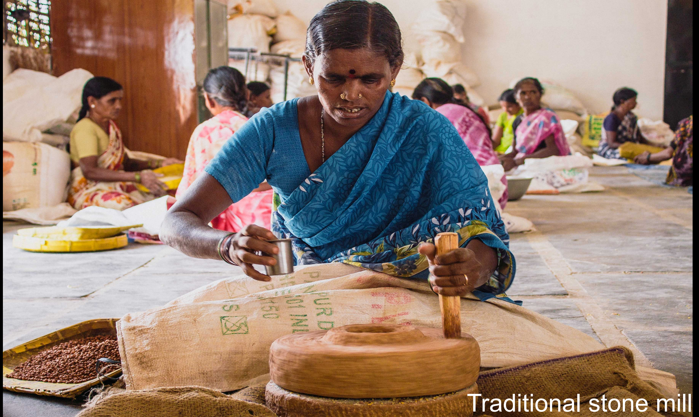
Traditional stone mill