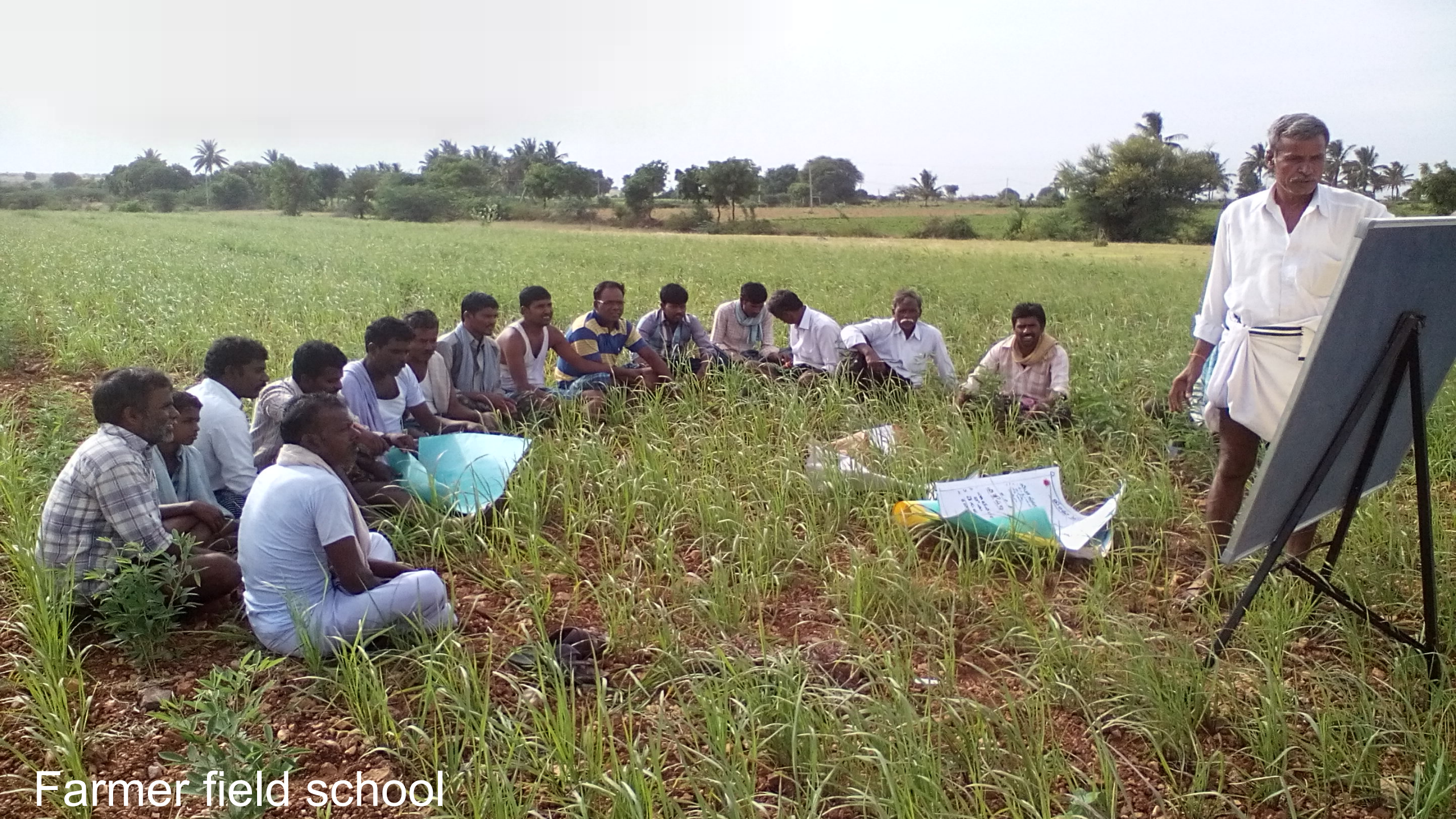
Farmer field school