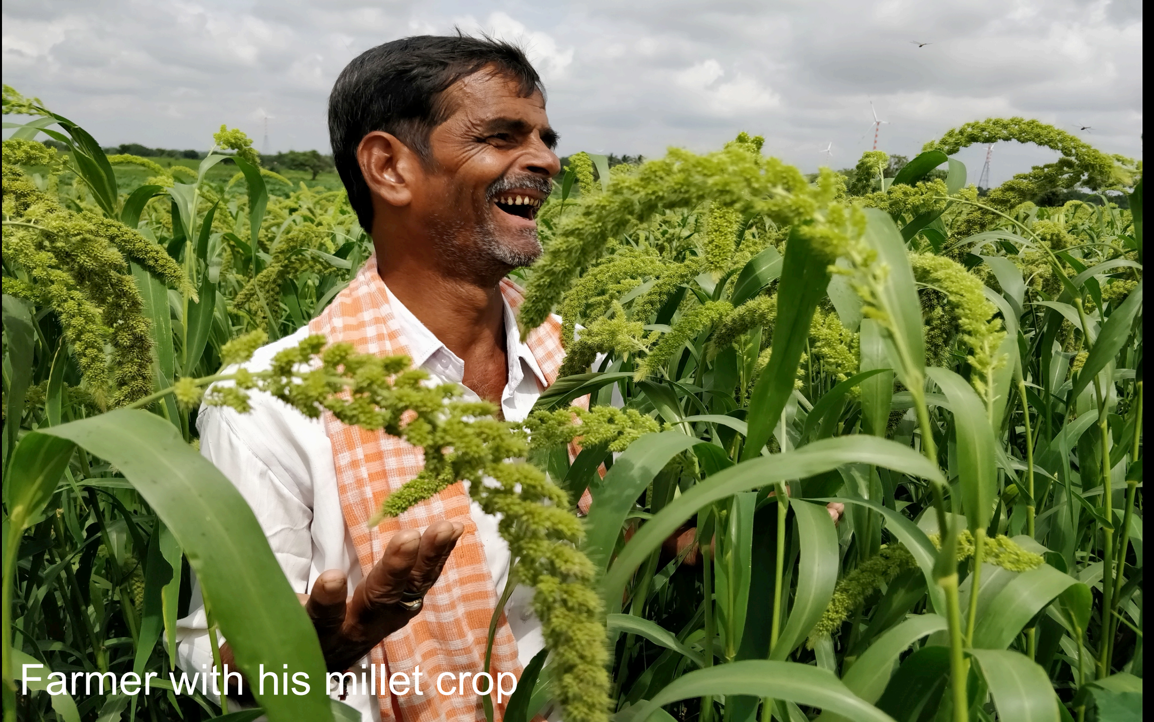
Farmer with his millet crop