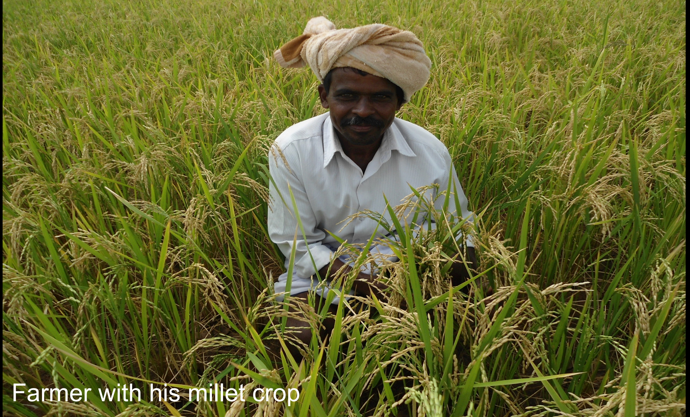
Farmer with his millet crop