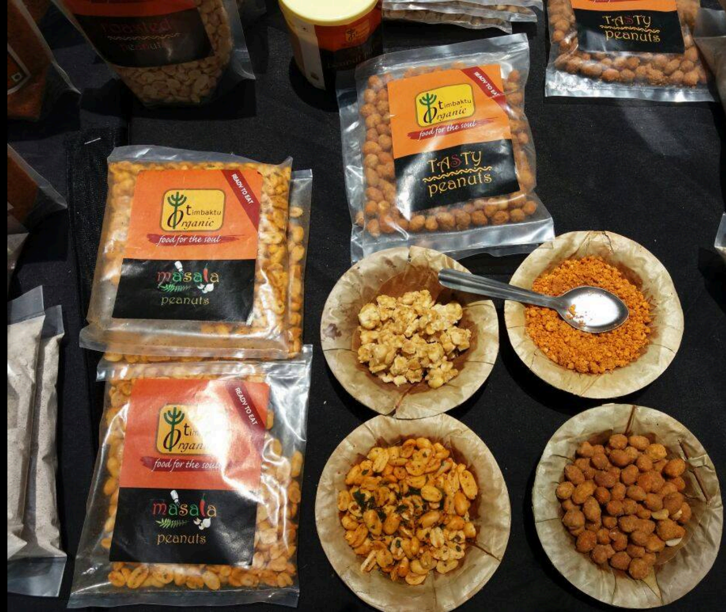
Timbaktu Organic products