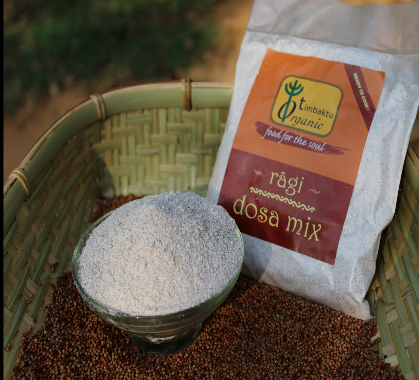
Timbaktu Organic products