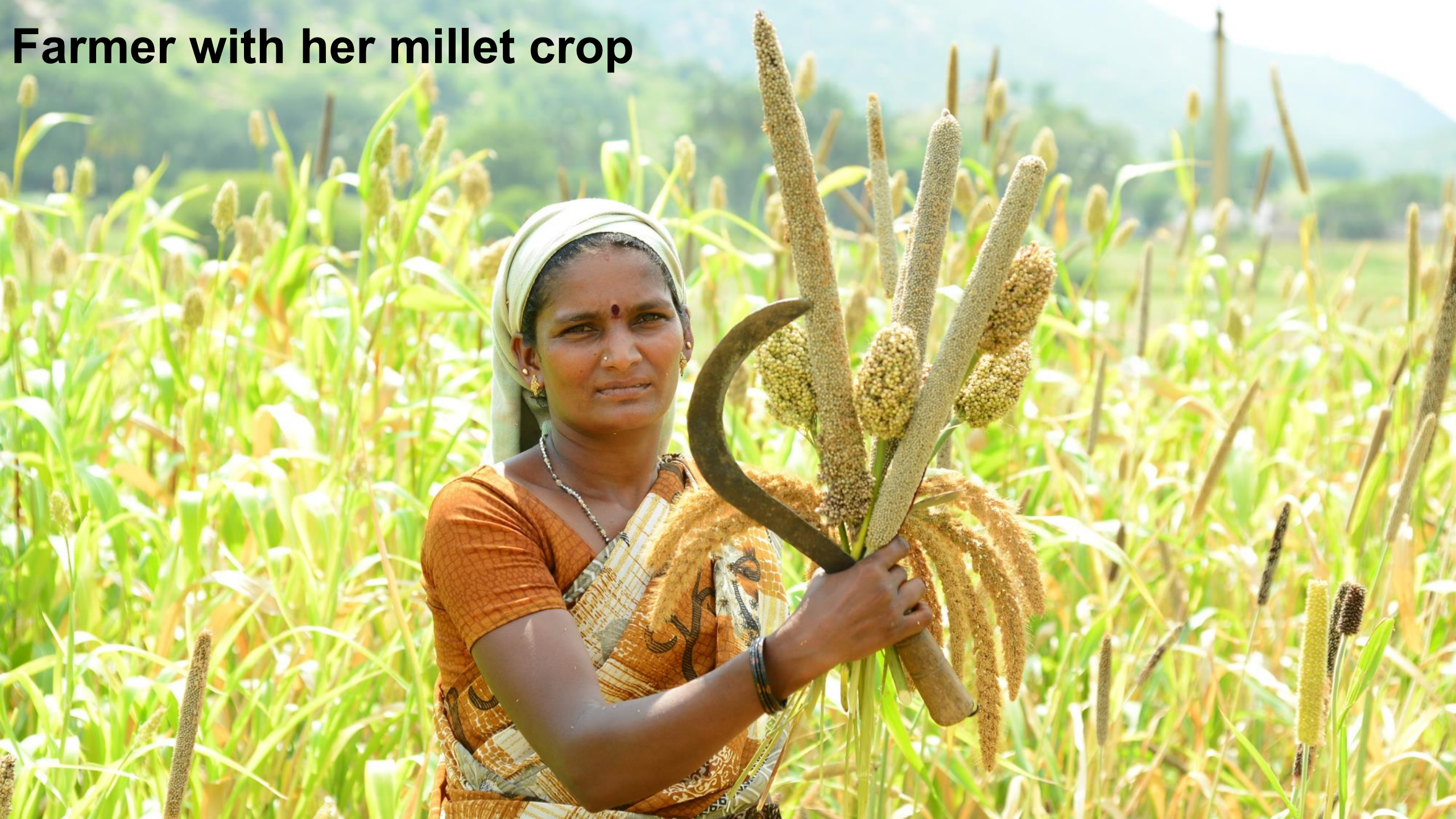
Farmer with her millet crop