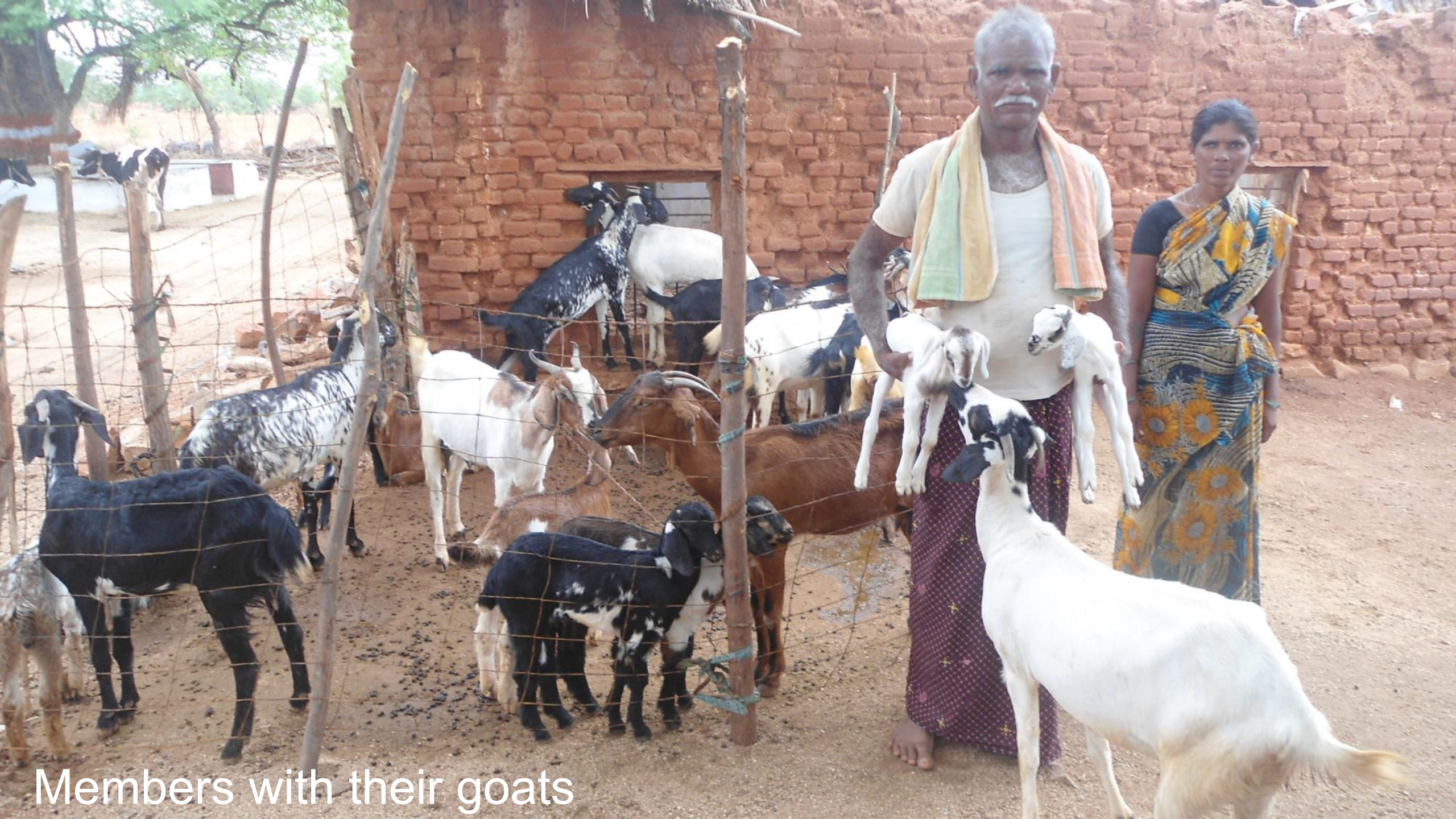
Members with their goats