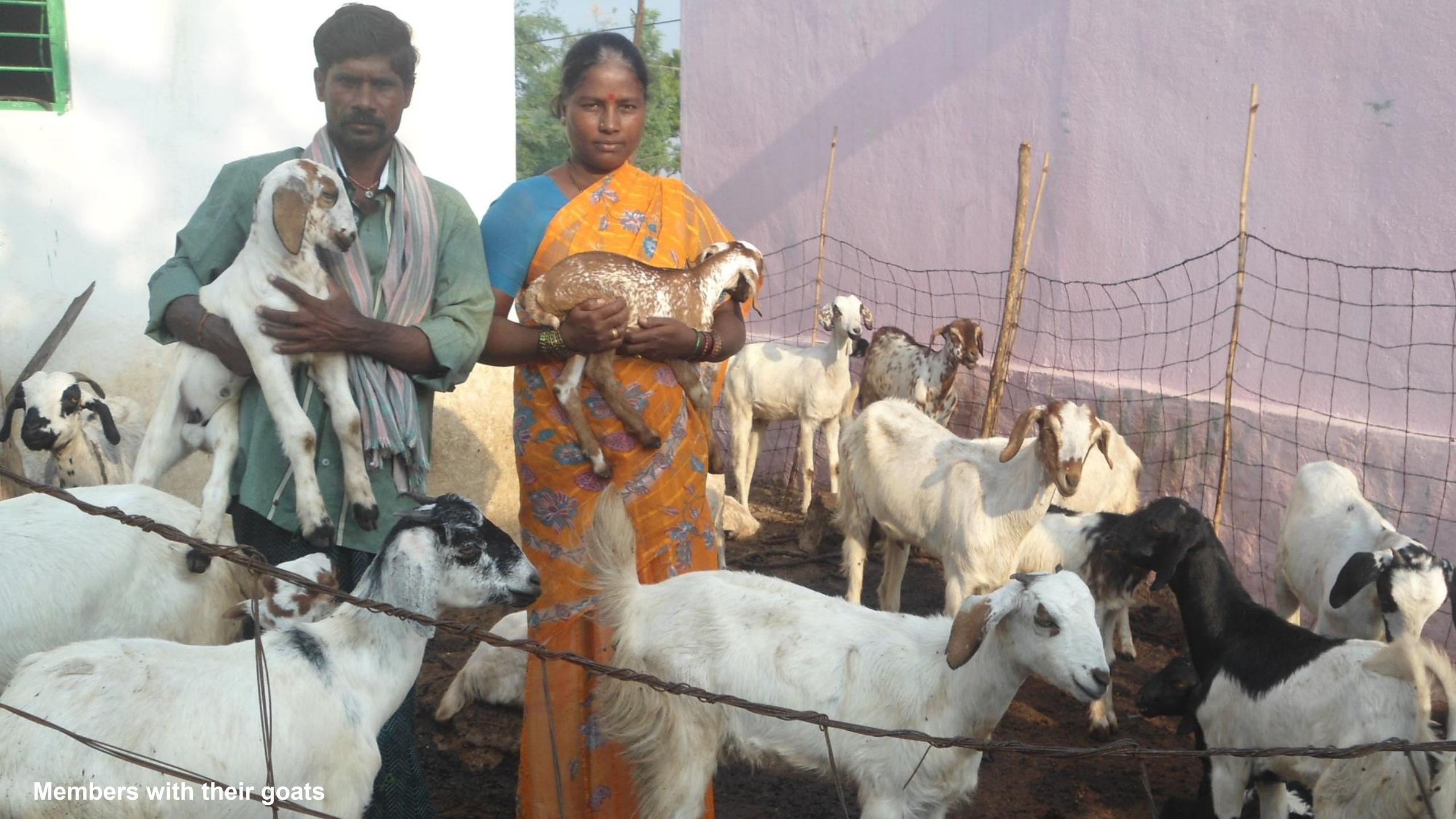
Members with their goats