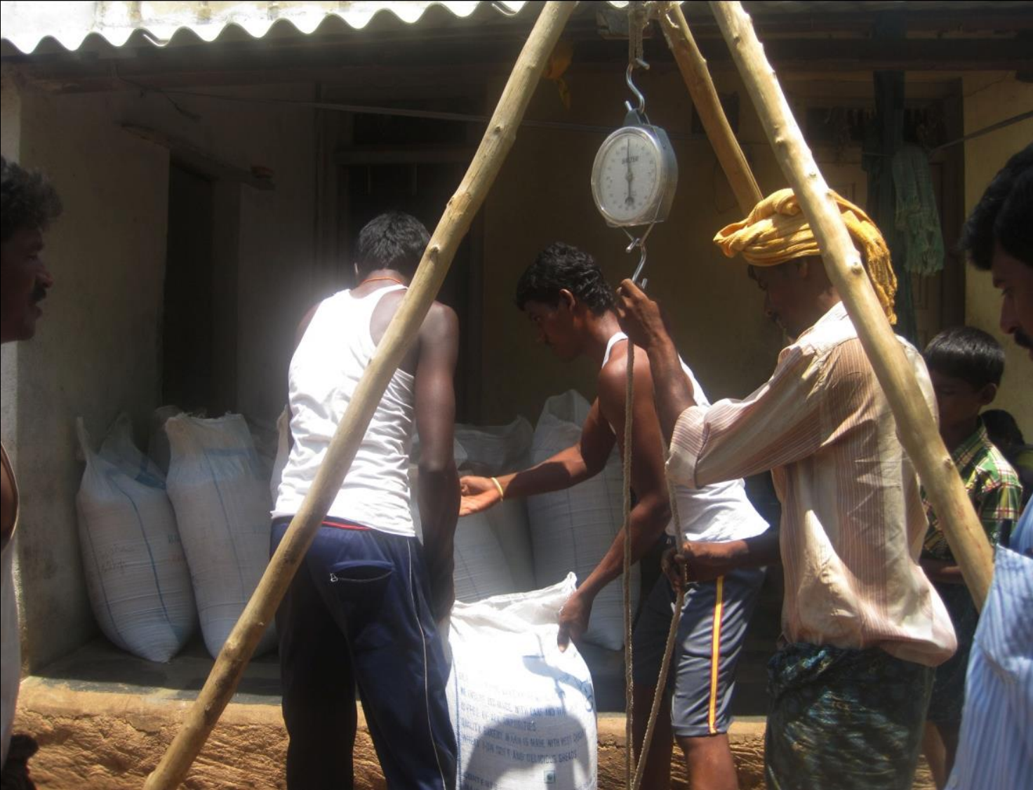
Procurement in progress